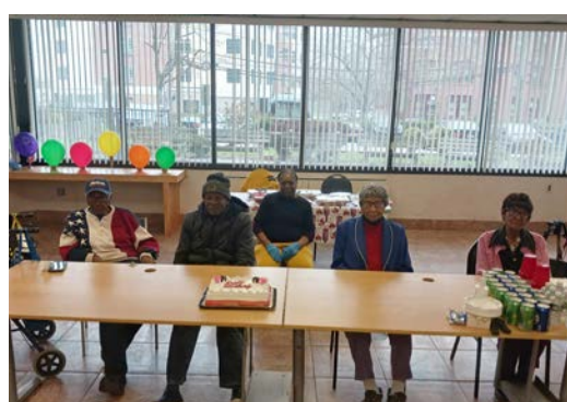
Residents of Associates celebrated March birthdays on March 27 in the Community Room.

Residents of Associates, 180 South Orange Ave., Newark, celebrated their birthdays in February and March. New Community wishes all the residents many more happy birthdays to come.