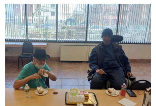
Associates residents with birthdays in February celebrated on Feb. 29 in the Community Room.