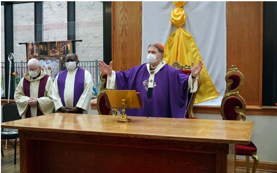
Cardinal Joseph Tobin conducts the inaugural mass at the New Community Extended Care Facility chapel on March 27.

New Community Extended Care Facility, 266 South Orange Ave., Newark, welcomed Cardinal Joseph Tobin, the Archbishop of Newark, for mass on March 27 where he blessed the facility's newly finished chapel.