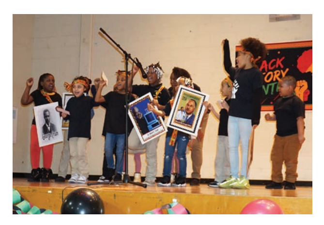
Students in the New Community Youth Services after school program shared facts and information about Black individuals during the department's Black History Month presentation on Feb. 24.