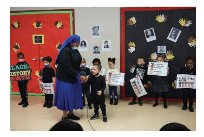
Students at Community Hills Early Learning Center (CHELC) held signs and spoke about Black Lives Matter during the school's Black History Month program on Feb. 24.

uring the month of February, New Community residents, students and staff members recognized Black History Month. Click here for more photos.