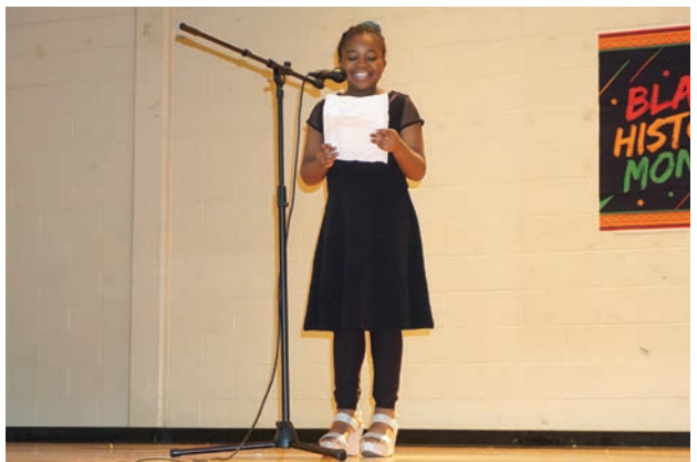
A student dressed as Ruby Bridges relays information about the historical figure during the New Community Youth Services Black History Month presentation on Feb. 24.