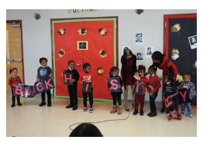
During the Black History Month program at Community Hills Early Learning Center (CHELC) on Feb. 24, children performed for their family members in the audience.