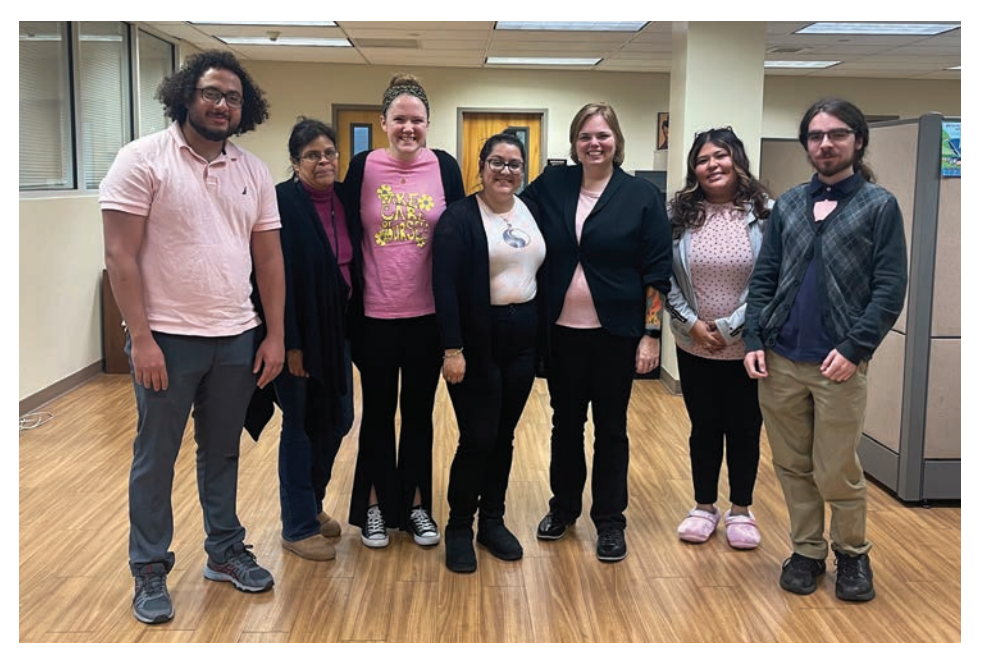
Staff members of Family Service Bureau of Newark (FSB) wore pink on Oct. 3 in honor of Mean Girls Day, which celebrates the 2004 movie. The team-building activity is meant to reduce workplace stress.