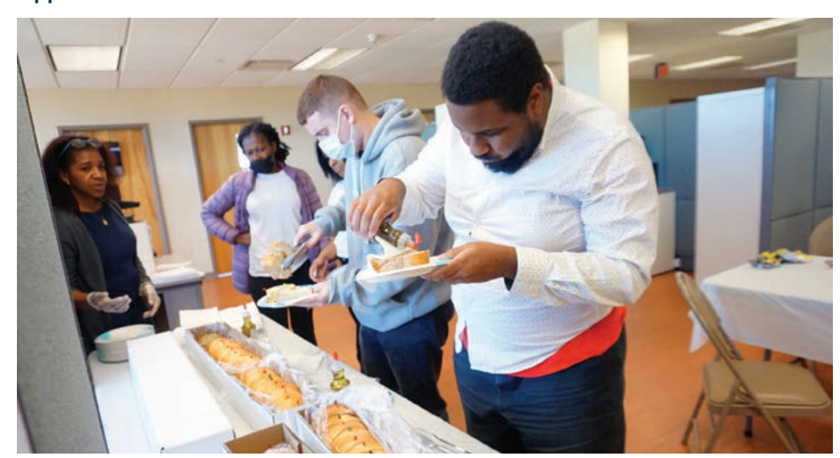
NCCTI students enjoyed sandwiches, drinks and cupcakes at the Student Appreciation Luncheon on Oct. 27.