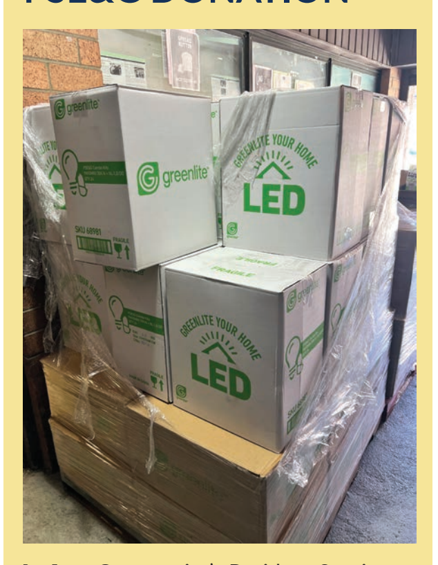
ew Community's Resident Services Department accepted a donation of light bulbs and power strips from PSE&G on Oct. 7.