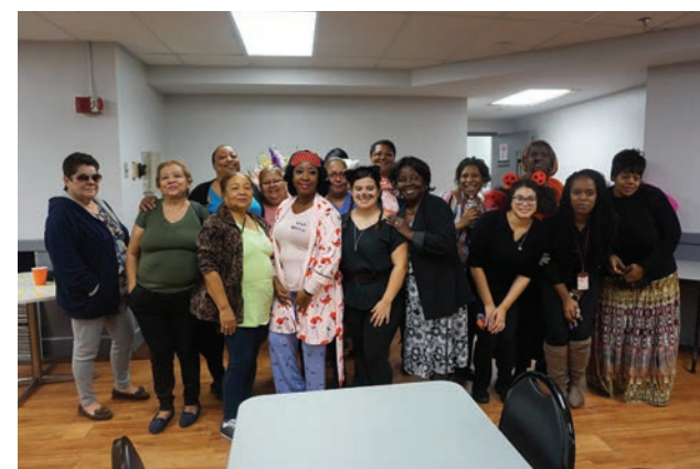
Commons Senior residents and Resident Services staff members gathered Oct. 31 to celebrate Halloween.