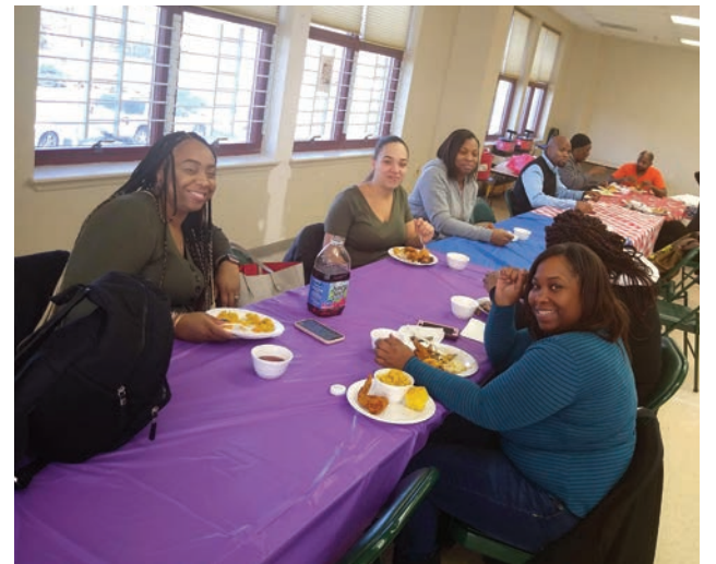
Parents enjoyed their own Thanksgiving lunch at CHELC.