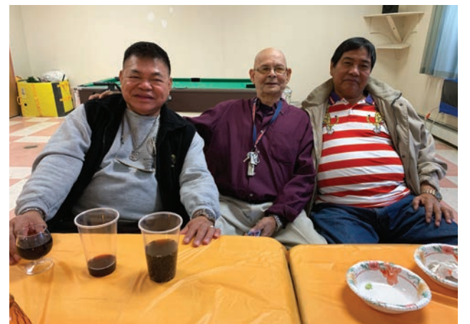
Hudson Senior residents enjoyed themselves at the Thanksgiving Party Nov. 18.