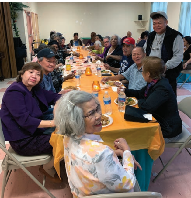
The Hudson Senior Community Room was full for the Thanksgiving Party Nov. 18.