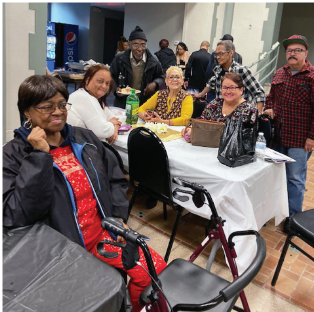
Douglas Homes residents gathered in the Community Room for the Thanksgiving celebration Nov. 22.