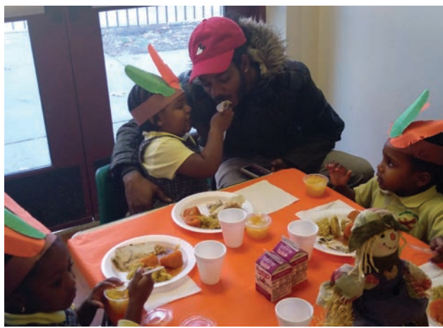
A student at CHELC offers up some of her Thanksgiving meal.