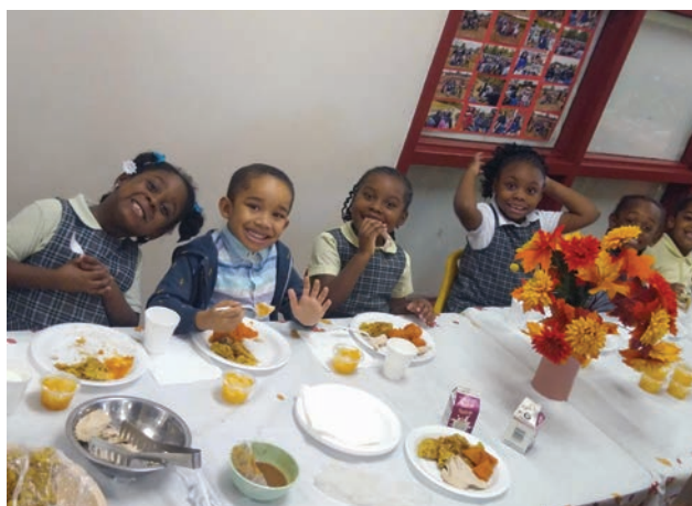
CHELC students were all smiles during their Thanksgiving celebration.