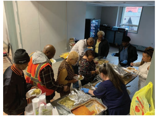
Residents of Douglas Homes enjoyed a Thanksgiving meal Nov. 22.