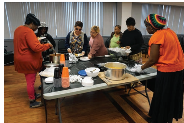
Residents of Commons Senior enjoyed a meal together at the building's Halloween Party Oct. 31.