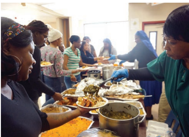
HHELC Staff members serve parents a Thanksgiving meal.