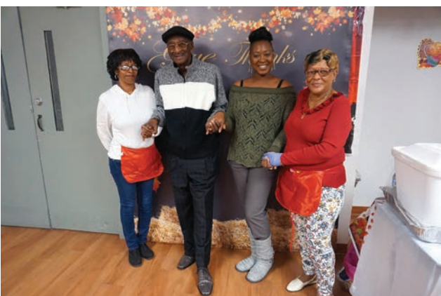
Attendees at the Gardens Senior Thanksgiving Luncheon Nov. 25 enjoyed themselves.