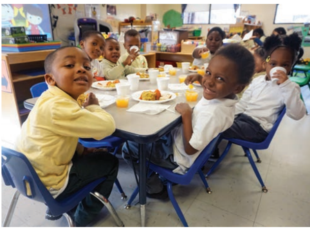
Children in the HHELC pre-K class enjoy a Thanksgiving lunch.

Community Hills Early Learning Center (CHELC) and Harmony House Early Learning Center (HHELC) held Thanksgiving celebrations Nov. 26. Children and parents enjoyed a Thanksgiving meal and time spent together before the holiday.