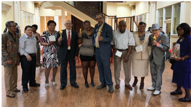
NCC residents participated in a dance competition, pitting building against building. Associates defeated Orange Senior, Roseville Senior beat Douglas Homes and Hudson Senior claimed victory over Gardens Senior.