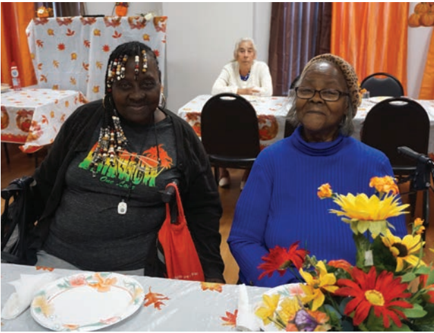
The Community Room at Gardens Senior was decked out for building's Thanksgiving Luncheon Nov. 25.