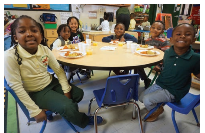
HHELC children celebrate Thanksgiving with a festive meal.