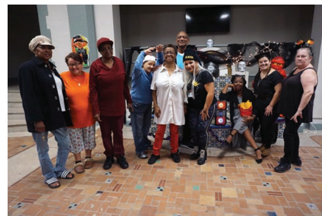
Douglas Homes residents and Resident Services staff members got in the Halloween spirit Oct. 31.

Commons Senior, 140 South Orange Ave., Newark, and Douglas Homes, 15 Hill St., Newark, both held Halloween parties for residents Oct. 31.