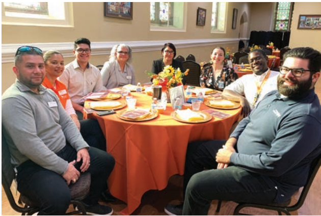
Resident Services thanks the community partners who contributed to the Harvest Ball and made the event a success.