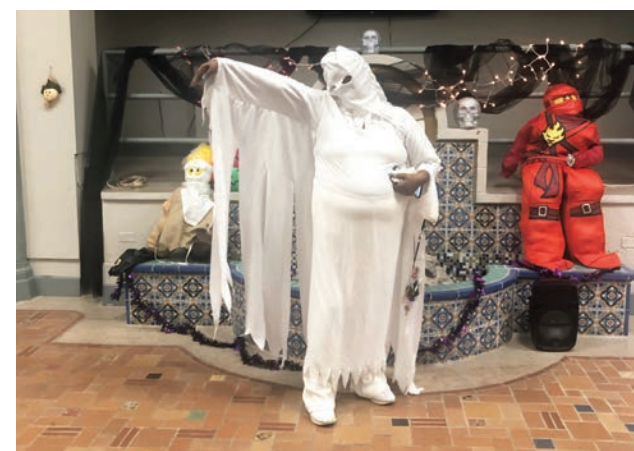
A mummy made an appearance at the Douglas Homes Halloween Party.