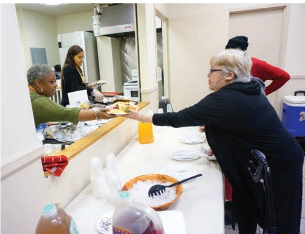
Food was plentiful at the Manor Senior Thanksgiving Luncheon Nov. 19.