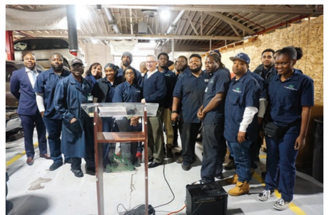
Students in the NCCTI Automotive Technician and Diesel Technician programs with former Gov. James McGreevey and other supporters.

ogies. NCCTI also operates a comprehensive Financial Opportunity Center and Bridges to Career Opportunities Program sponsored by the local and national Local Initiatives Support Corporation (LISC) offices. For more information, call 973-824-6484, log onto newcommunitytech.edu or visit 274 South Orange Ave., Newark.