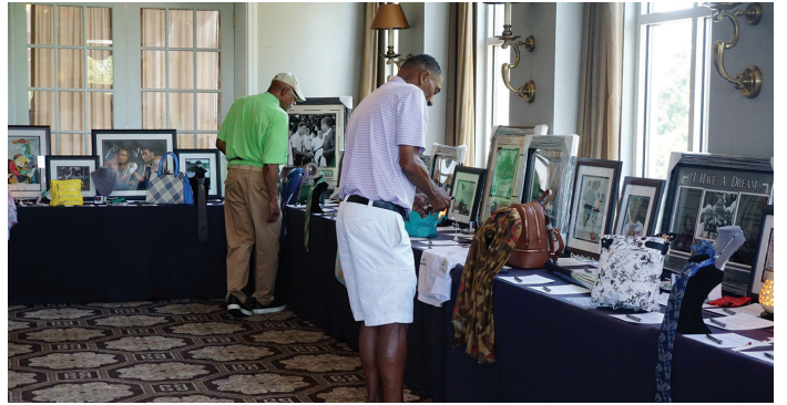
Participants bid on items during the silent auction available at the 25th Annual Golf Classic.